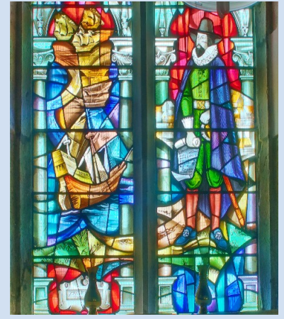
Pilgrim Window in Stambridge Church