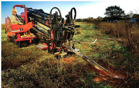
A small directional drilling rig of the type used for short distances in Stambridge. The rig being used to go under the rivers is significantly larger.

We have all been very aware of the roadworks along Stambridge Road over the past few months. There were several concerns about them e.g. there was damage to footpaths and the traffic management was poor with unnecessary delays. The Parish Council has complained to Morrisons UC about them.